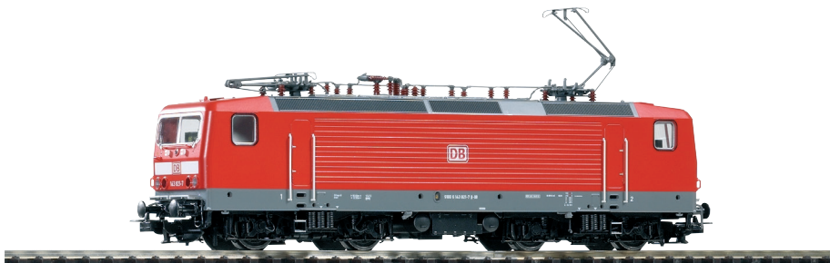
51706 Electric locomotive Class 143 DB AG era VI, with double lamp 51707 ~ Electric locomotive Class 143 DB AG era VI, with double lamp

The following applies to all Class 143 locos