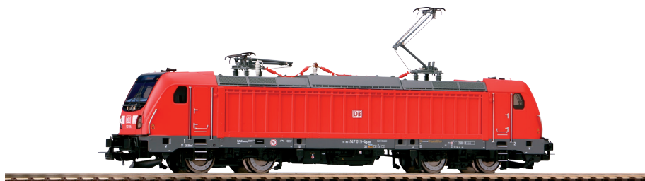
51580 Electric locomotive Class 147 DB AG era VI 51581 ~ Electric locomotive Class 147 DB AG era VI

The following applies to all Class 147 locos