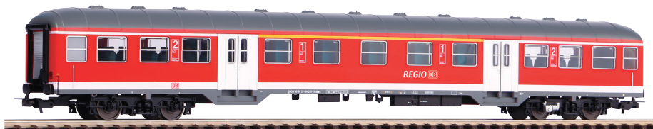
57676 Commuter car n-car 1st/2nd class DB AG era VI