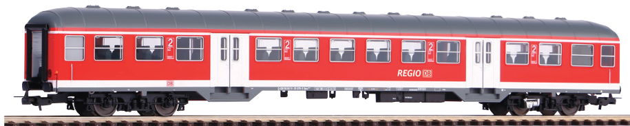
57675 Commuter car n-car 2nd class DB AG era VI