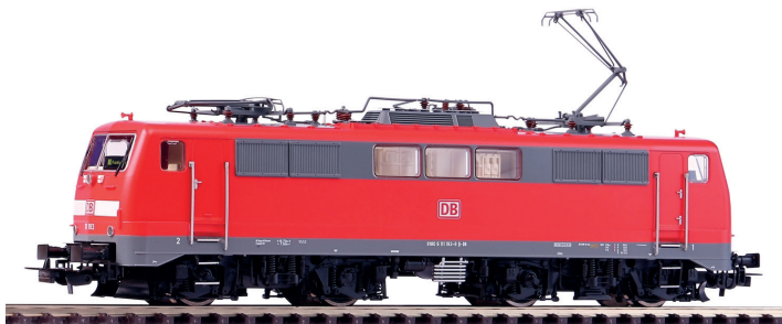
51840 Electric locomotive Class 111 DB AG era VI 51841 ~ Electric locomotive Class 111 DB AG era VI

The following applies to all Class 111 locos