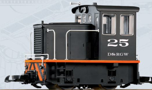
38500 D&RGW 25-Ton Diesel Switcher (Track-Powered)

See our website for the full selection of GE 25-Ton Diesel models currently available.