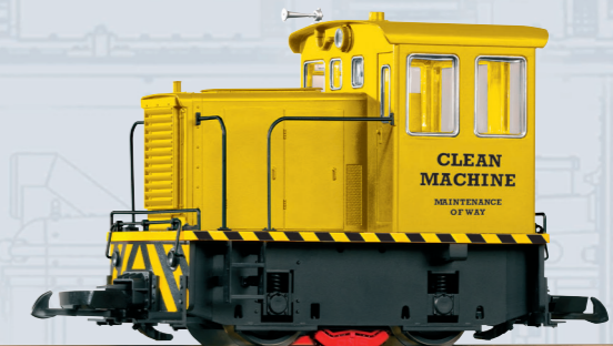
38501 Clean Machine Track Cleaning Loco, incl. 4 Cleaning Shoes

With the "Clean Machine" version of the GE 25-Ton diesel, PIKO introduces a completely new concept in track cleaning. Common household rechargeable batteries provide extensive running time. Track cleaning operation is simple - just turn it on and let it run around the layout till even heavily oxidized track is polished clean. Once the Clean Machine has cleared the way, track-powered locos can run smoothly! The loco is equipped with a power switch on the bottom of the chassis that can easily be reached while the loco is on the track. The switch controls Forward, Stop and Reverse. This makes it easy to run two Clean Machines coupled back-to-back for even faster track cleaning.