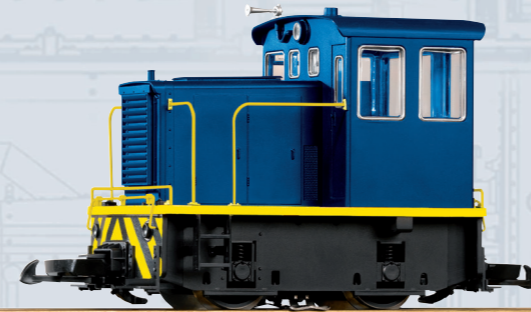
38502 Blue Goose 25-Ton Diesel Switcher (Track-Powered)