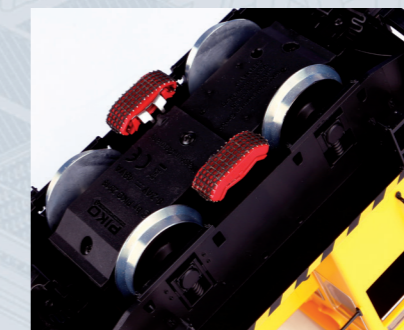
35416 Track Cleaning Shoes, 2 Sets

The Clean Machine is exclusively powered by 6 'AAA' batteries (not included - high-capacity rechargeable cells are recommended), which provide up to two hours of running time for cleaning even large layouts. The front "radiator panel" of the engine hood opens for easy access to the quick-change battery clip.