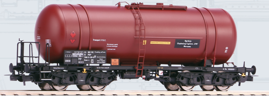
58450 PKP Zas (406Ra) Tank Car IV

The car can be unloaded through a drain valve at the side of the car, partly with the help of a pump. The tank cars are approved for a maximum speed of 100 km/h and have been partly modified during their service terms. The tank cars 406R are still used in freight trains today.