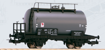
58753 2-Axle Tank PK IV