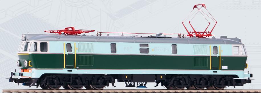
96332 Electric Locomotive ET22-357 PKP IV