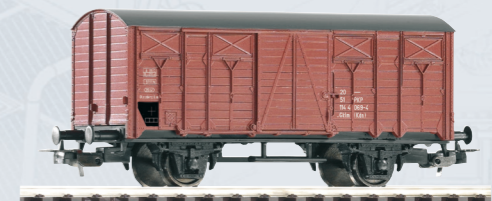
58762 Boxcar Gklm PK IV