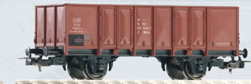
58760 Gondola Wddo PK IV